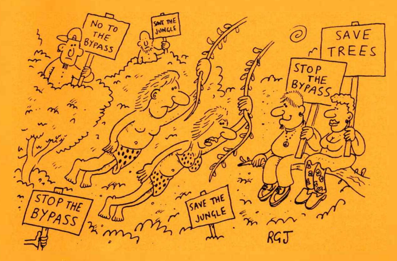
'Swinging through the treetops just isn't the same any more, Tarzan.'